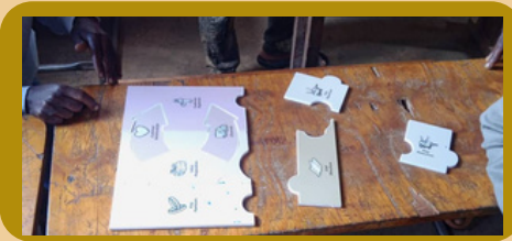
Building a business model