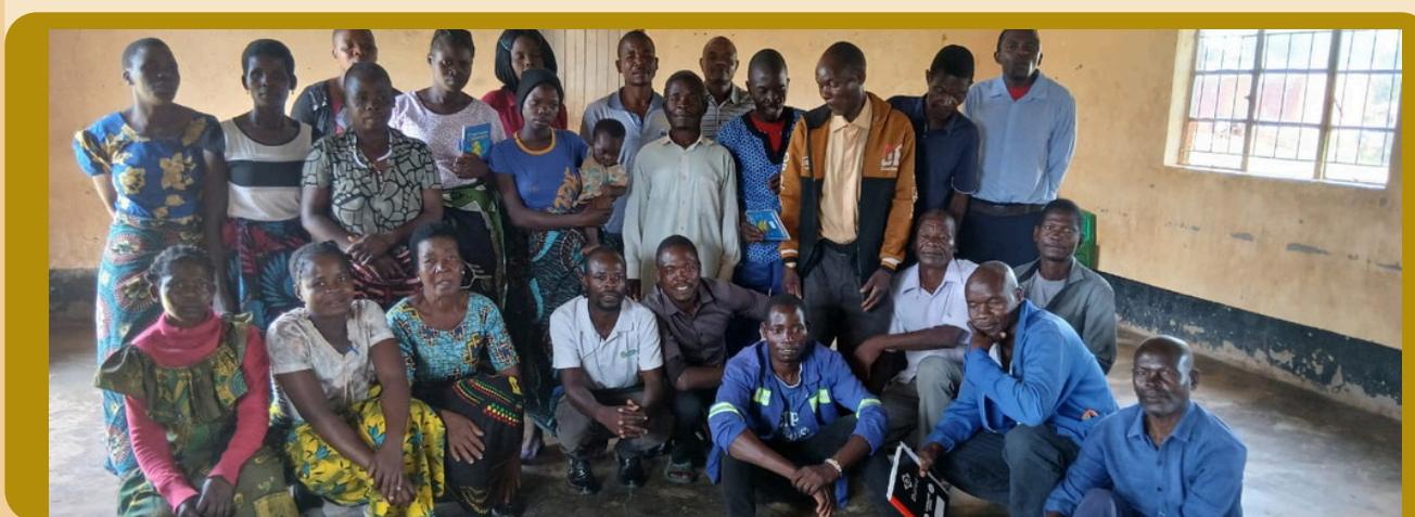
Sustainable fish farming practices