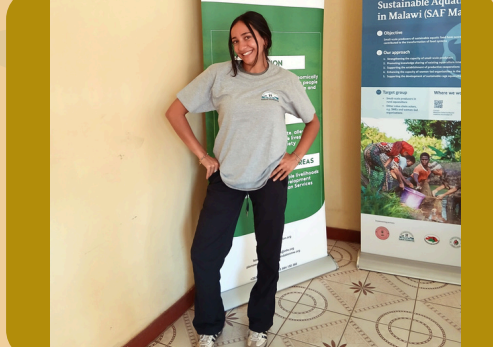
Volunteer Farewell - Facebook Post