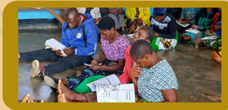
Me as a change maker