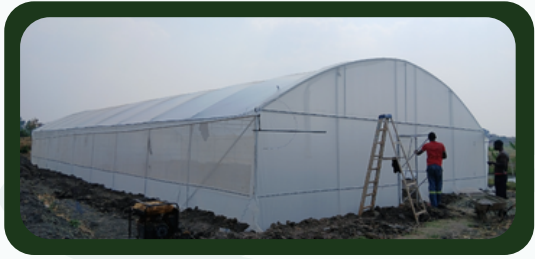
Greenhouse Installation process.