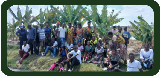
Participants after Sustainable Greenhouse Practice Training.

This Project is funded by Global Affairs Canada through WUSC-Canada