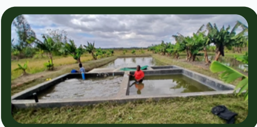
Completing Pond maintenance.