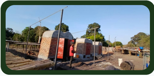
Smoking kiln production.