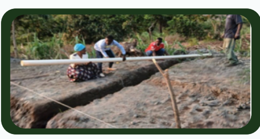
Outlining pipe installation for pond maintenance.