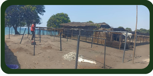
Metal drying racks in Nkhatabay District.

This Project is funded by Global Environment Facility Small Grants Program UNDP