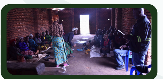
Training Fish Farmers on best practices.