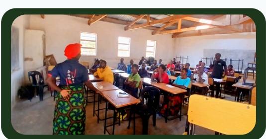
Refresher course participants.